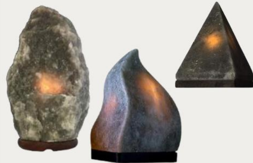
OUR BLACK SALTWARE