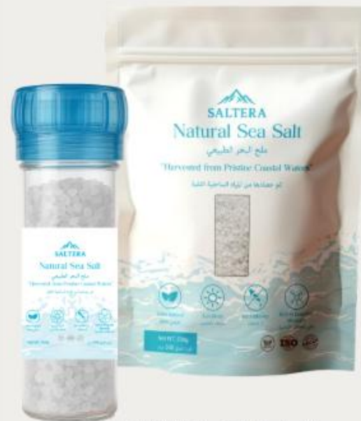
OUR SEA SALTS