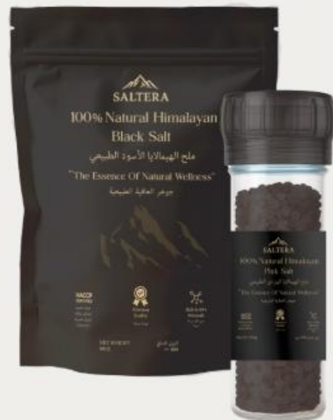
OUR BLACK SALTS