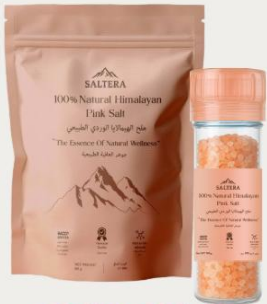
OUR PINK SALTS