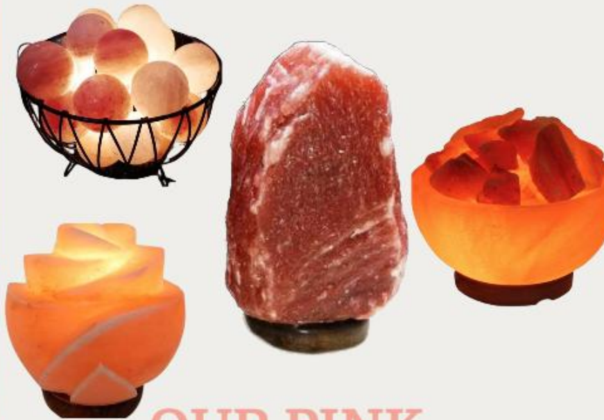
OUR PINK SALTWARE