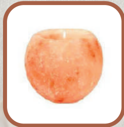
Himalayan Drum Shape Candle Holder