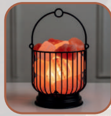
Himalayn Round Basket Lamp