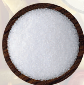
Extra Fine Sea Salt