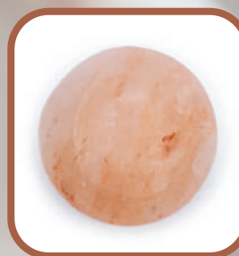
Himalayan Salt Massage Roller Stone