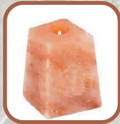
Himalayan Cave Shape Candle Holder