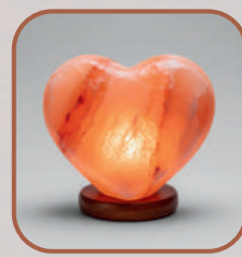
Himalayn Heart Shape Lamp