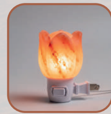
Himalayn Square With Chunks Lamp