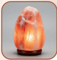
Himalayn Natural Shape Lamp