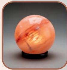
Himalayn Globe Shape Lamp