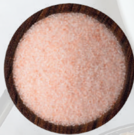
Fine Salt Dark Pink