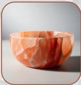
Himalayan Salad Bowl