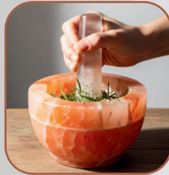
Himalayan Pink Salt Pestle