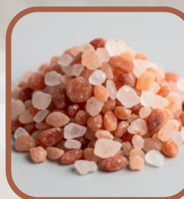
Himalayan Salt Hell Scraper