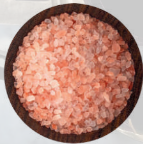
Crystal Salt Granules Light Pink