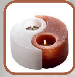
Himalayan Holder Yin- Yan Shape Candle Holder