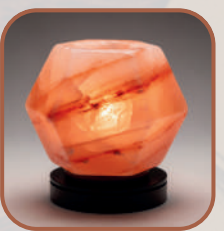
Himalayn Hexagon With Ball Lamp