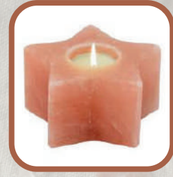
Himalayan Star Stone Candle Holder