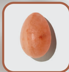
Himalayan Salt Egg Shape Soap