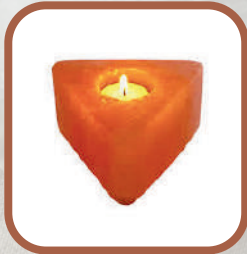
Himalayan Triangle Shape Candle Holder