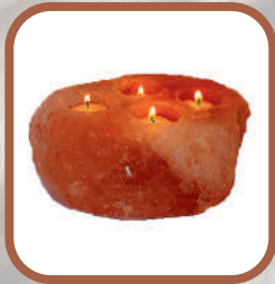
Himalayan Rock Shape Candle Holder