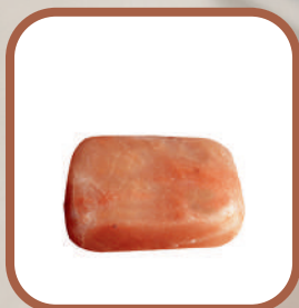
Himalayan Salt Soap Massage Stone