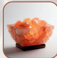
Himalayn Square With Chunks Lamp