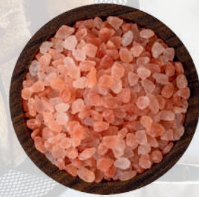
Crystal Salt Granules Dark Pink