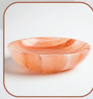
Himalayan Salt Serving Pestle