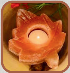
Himalayan Leaf Shape Candle Holder