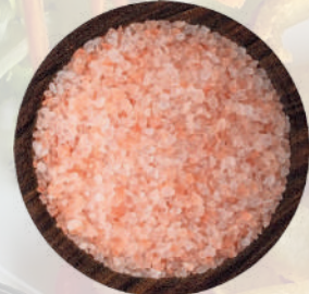
Fine Salt Light Pink