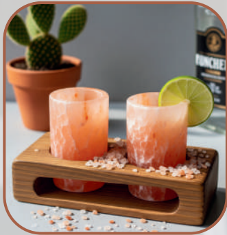
Himalayan Salt Tequila Glasses