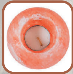
Himalayan Round Shape Candle Holder