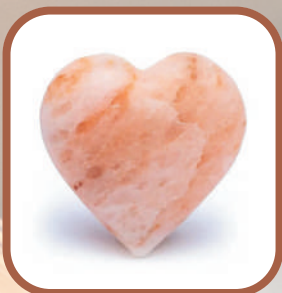
Himalayan Salt Heart Shape Soap