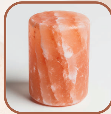
Himalayan Natural Cylinder Lick Salt