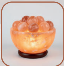
Himalayn Round With Ball Lamp