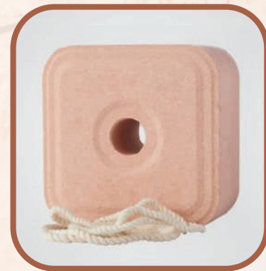
Himalayan Compress Lick Salt