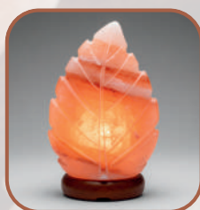
Himalayn Leaf Shape Lamp