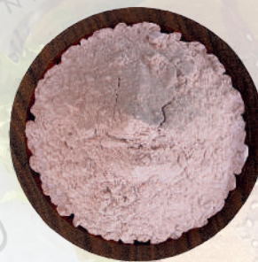
Extra Fine Black Salt