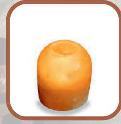
Himalayan Bullet Shape Candle Holder