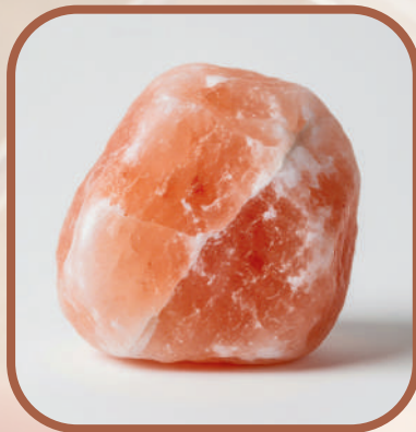
Himalayan Natural Lick Salt