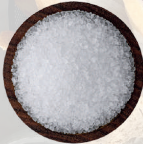
Crystal Granules Sea Salt