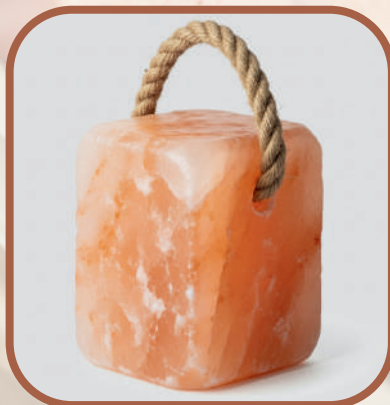
Himalayan Lick Salt With Rope