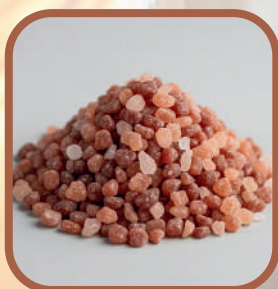
Himalayan Crystal salt granules light pink