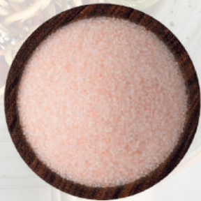
Extra Fine Salt Light Pink