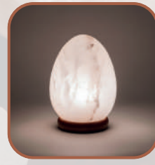
Himalayn Egg Shape USB Lamp