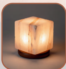
Himalayn Rectangle Shape Lamp