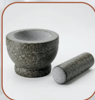
Mortar & Pestle